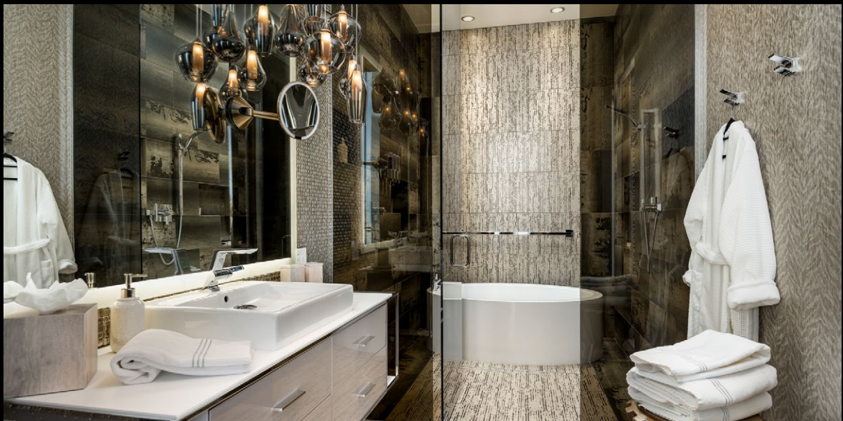
BEST OVERALL BATH