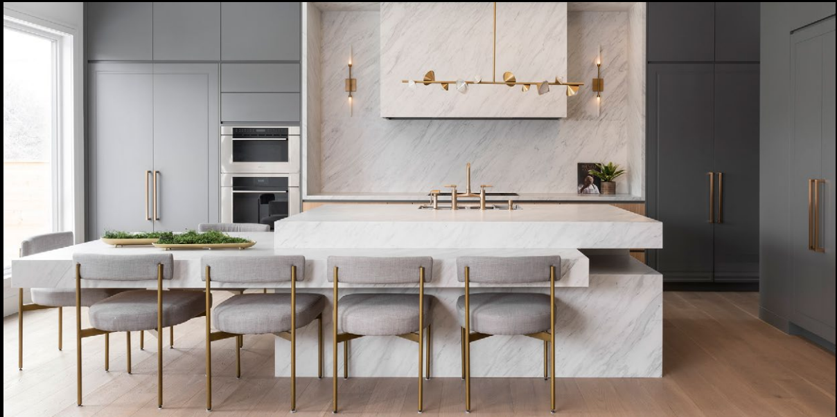
BEST OVERALL KITCHEN