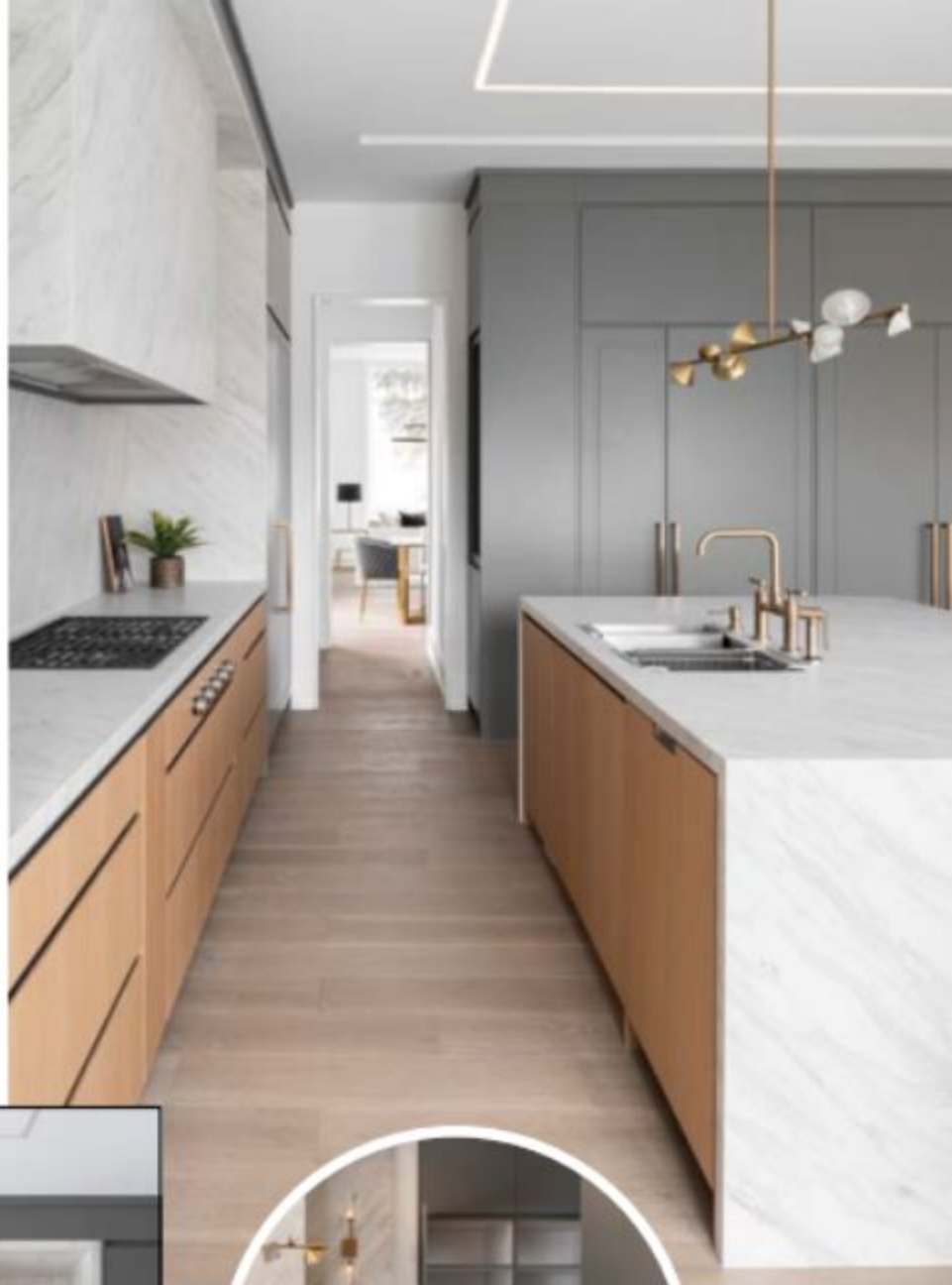
LEFT: The sleek and streamlined kitchen is made cosy with warm wood cabinetry and gold hardware. BELOW: It's all in the details with this build. The layered marble fireplace surround adds texture and dimension. TOP & BOTTOM RIGHT: The open floor plan is full of interesting architectural details, like the sculptural wall divider and the designer ceiling with LED lighting.

The developing area is a blend of traditional and timeless interspersed with modern new builds. The quality and overall aesthetic of the homes are designed to appeal to the lifestyle of the family seeking a home in the area. “We felt modern is interesting