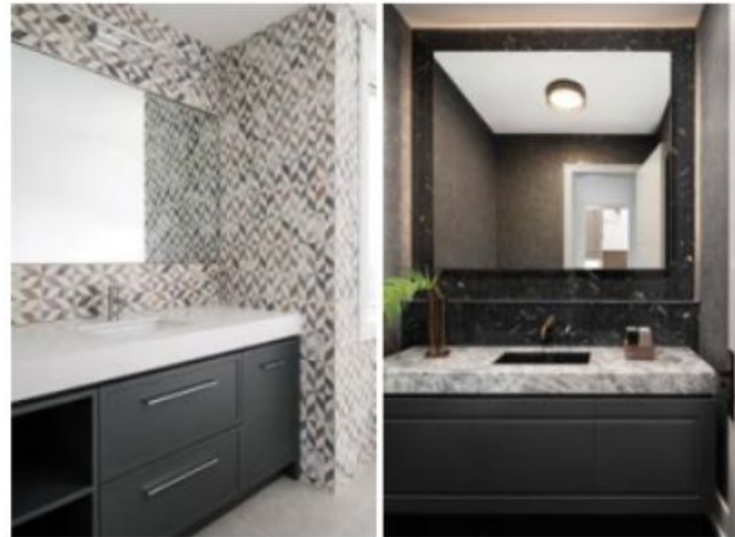
TOP: A linear fireplace is the focal point in the living room furnished with modern comfortable seating. LEFT: Visual barriers in main living areas are avoided with simple design elements like the glass staircase. ABOVE LEFT & RIGHT: People often think of texture in terms of textiles and woven fabrics, but tiles and solid surfaces offer wonderful textural backdrops as well. OPPOSITE: A charcoal room divider is a unique architectural feature incorporating the same stone that surrounds the fireplace.