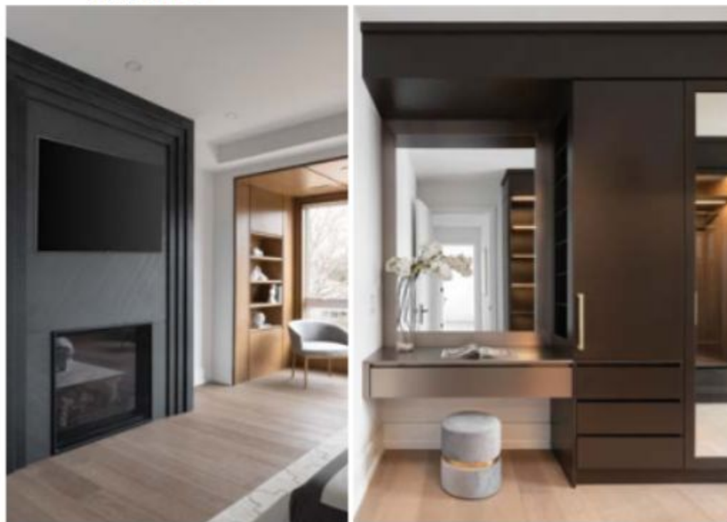
ABOVE LEFT: The designers were not afraid to use dramatic colours to add definition and create strong focal points. Here, the rich tones of the fireplace add warmth. ABOVE RIGHT: The en suite cabinetry is functional and sculptural. BELOW: To draw the eye away from the bulkhead and effectively use the space, the designers integrated a cosy nook by the window in the primary bedroom.

The teams worked in synergy on many of the elements throughout, a testament to how the right partnership is vital when it comes to design and execution. The cantilever-style island required a great deal of coordination to ensure the structure's stability. "We can design without limits, but for the execution of the design, the builder needs to be open to new ideas to collaborate with the designer and be able to execute the idea without saying 'it can't be done,'" Shima says.